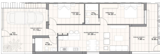
Apartmento 1. TIPO A Apartment 1. TYPE A